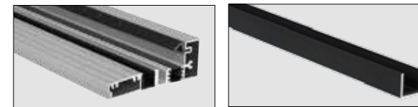
WEATHER RESISTANT SILL FLUSH GUIDE SILL